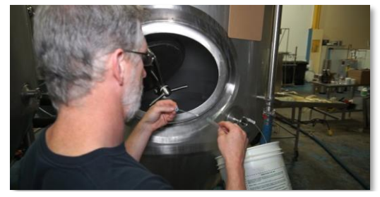
Demonstrating swab preparation for off-site analysis

To understand how well the solutions had cleaned or sanitized, baseline measurements were made on the mashtun, brew kettle, and fermenter, as noted in the table below. The results showed that after rinsing and cleaning the mashtun using the original rinsing and cleaning process, bacteria was present. (After initial testing on the mashtun, a decision was made to focus on the brew kettle and fermenter, given that wort coming from the mashtun would be exposed to a minimum 60-minute full boil and another 30 minutes above pasteurization temperature. Risks for post-boil parts of the process were more of a concern.) The brew kettle monitoring indicated ATP readings below five throughout the process as well as no detection of bacteria from the samples sent off site for testing. For the fermenter, the ATP readings dropped throughout the rinsing, cleaning, and sanitizing processes to five counts or less. There was no detectable bacterial growth detected for the off-site swab samples.