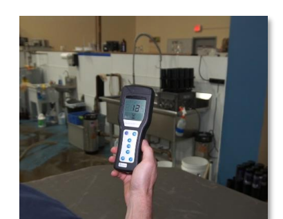
Demonstrating use of the ATP meter